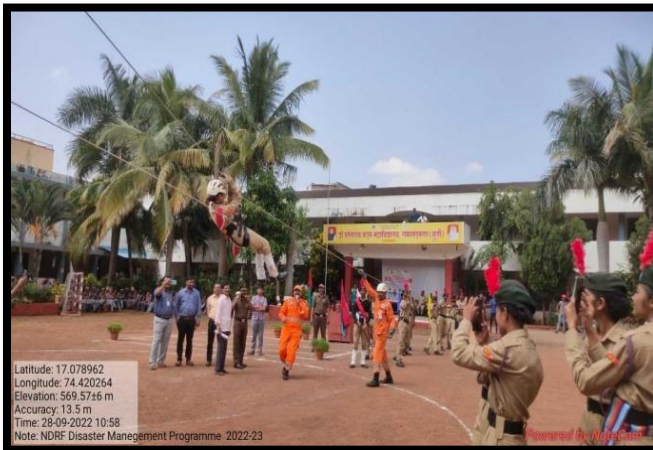
NCC cadets as well faculty participated in demonstration of drills and experienced the thrill of rescue operations.