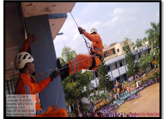
NDRF team from Pune demonstrated stunning drills executed during rescue operations.