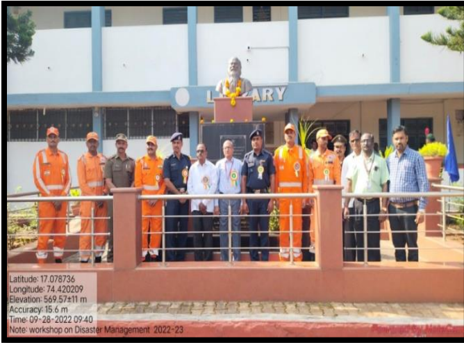
Dignitaries offering tribute to Statue of Padmbhushan Dr. Karmveer Bhaurao Patil in college premise.