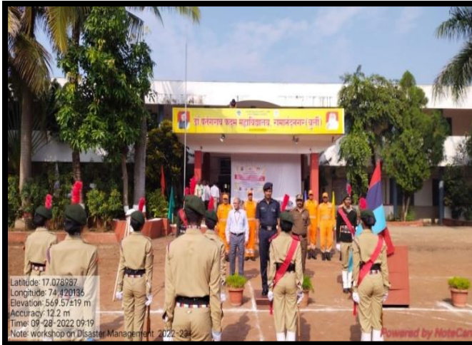
Command of Inspector receiving guard of honor.